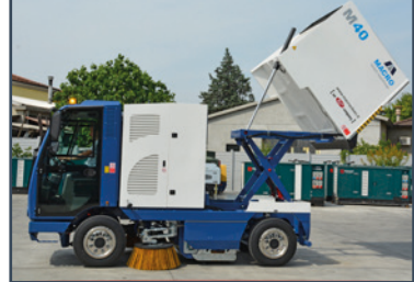
Dumping at any height between 1,05 and 2,1 m.