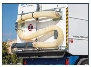
Rear powerful wandering vacuum hose, 6 m lenght -140 mm diameter. High pressure washing system (140÷200bar) w. spray-gun and 12m-hose reel.