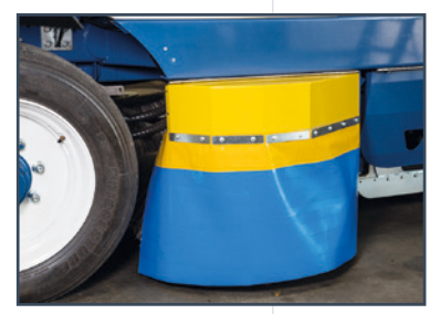
Side brush dust suppression skirts for dry dust-free sweeping.