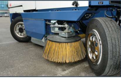
The machine is available also in 4 wheels traction configuration, for the most demending environments.