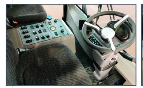
Spacious and comfortable cabin with 2 homologated seats and user-friendly controls.