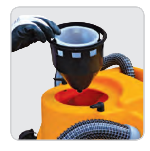
Easy suction filter cleaning.